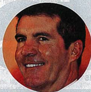
C SIMON COWELL Cantankerous American Idol judge and recording exec, 49