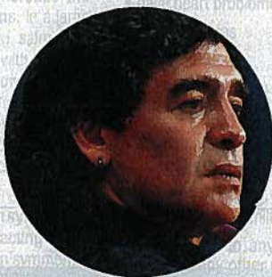
B DIEGO MARADONA Argentine soccer legend, 48, who scored "hand of God" goal in 1986