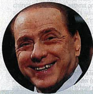
A SILVIO BERLUSCONI Elected in April 2008 at age 71 to a third term as Prime Minister of Italy