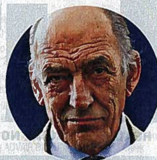
D GENERAL SIR MIKE JACKSON Former British Army Chief, 64, who retired in 2006